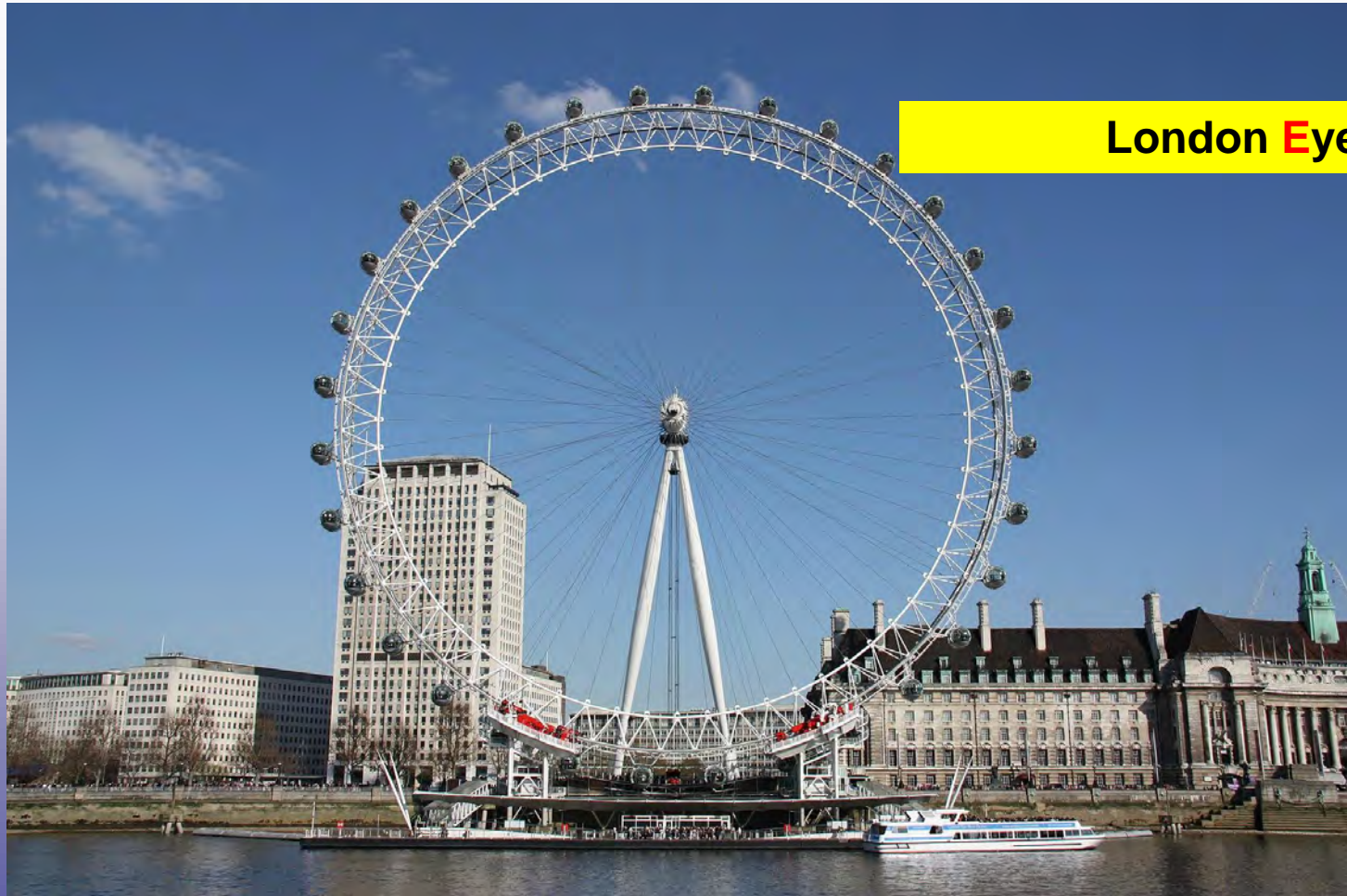
London E ye

Since it started operations in 2000 the Ferris wheel has become one of London's best -known landmarks. What is it called? We need the first letter of the 2nd word.