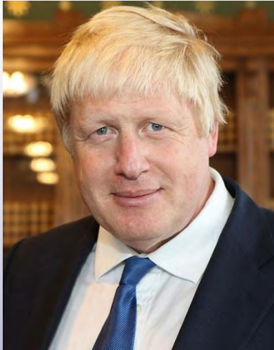
Boris Johnson, 2019 - 2022