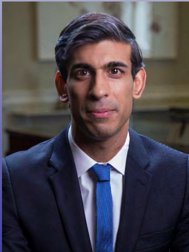
Rishi Sunak, 2022 - 2024