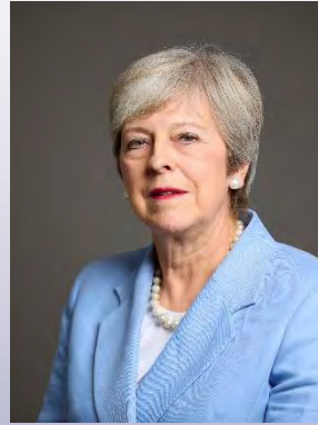
b) Theresa May