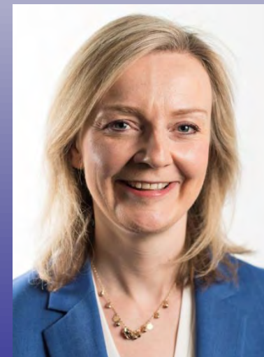
Liz Truss, 2022