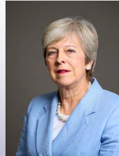
Theresa May, 2016 - 2019