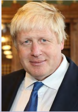
a) Boris Johnson