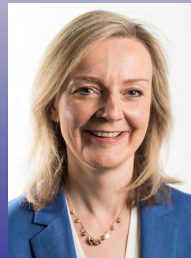
Liz Truss, 2022