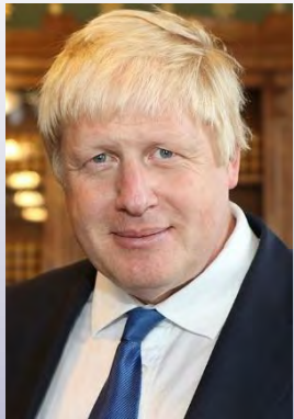
a) Boris Johnson