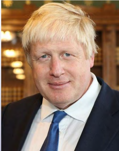
Boris Johnson, 2019 - 2022