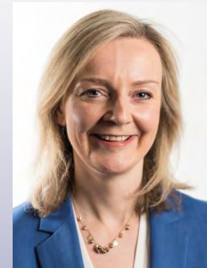
d) Liz Truss

The names of the former British prime ministers appear in alphabetical order. Arrange them in chronological order.