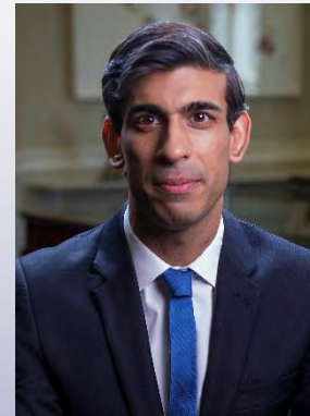
c) Rishi Sunak