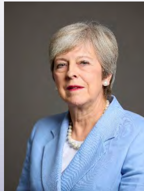
b) Theresa May