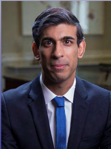
Rishi Sunak, 2022 - 2024