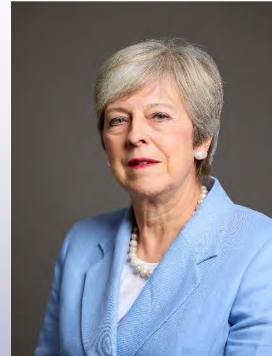
Theresa May, 2016 - 2019