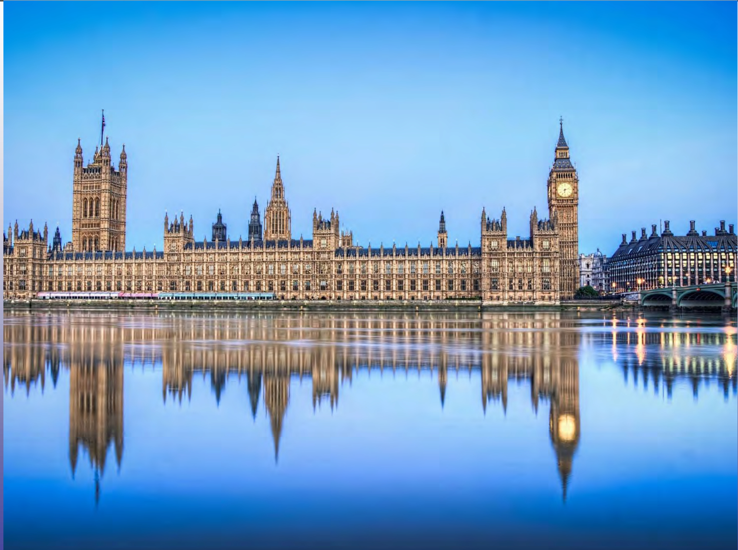
The Palace of Westminster, home of the British Parliament