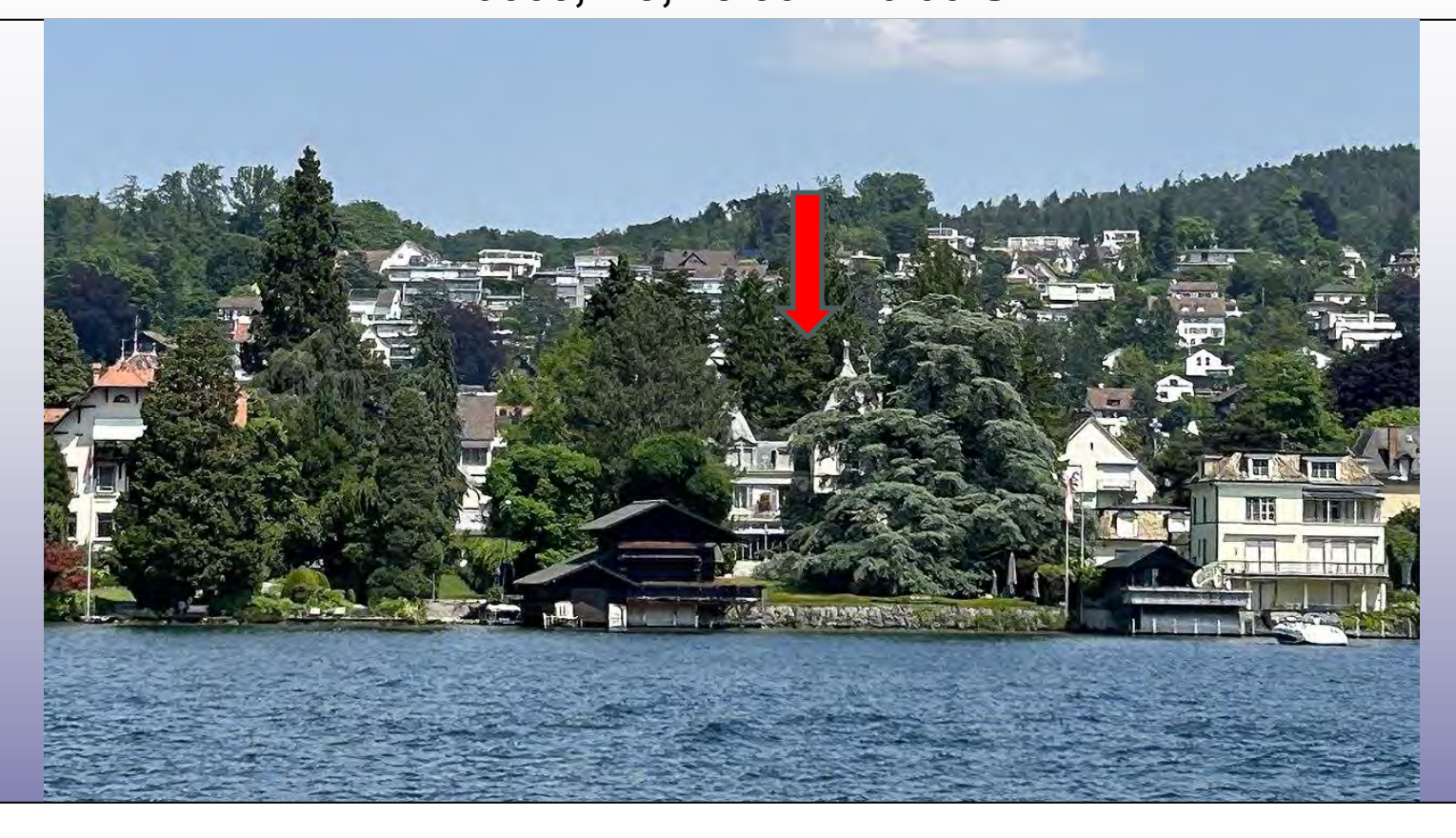
Villa Algonquin in Küsnacht on the Lake Lucerne